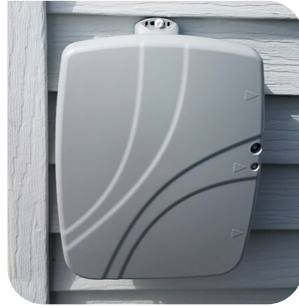
ONT attached to the side of a house.

A few years ago, getting online meant connecting a modem to your phone line—and who could forget that infamous screeching sound? Thankfully, those days are behind us. Nowadays, fiber-optic Internet is more like upgrading from a horse-drawn carriage to a high-speed sports car. And that means new and interesting devices. Today, you have a small box, typically located outside, called an ONT—that stands for Optical Network Terminal. It might seem like a fancy modem, but there's an important difference worth understanding.