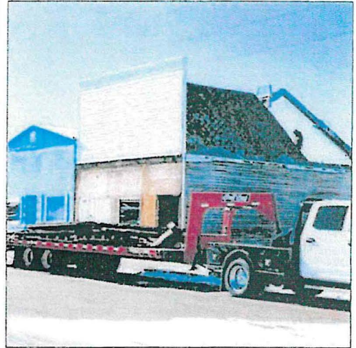
The original First State Bank building, one of the oldest structures on Timber Lake's Main Street, was demolished last week.