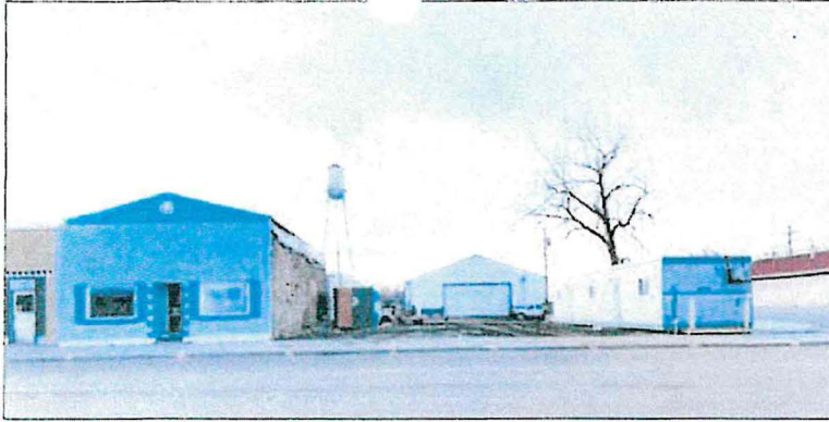
Demolition of the Schlosser building opened a spot where owner Stan Schlosser plans to move the small building shown at right to replace it. The blue building at left was formerly the Senior Center, then storage for Biegler Equipment, and later Lilian Turcotte's vintage shop.