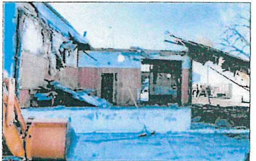
The concrete vault of the old First State Bank was intact.