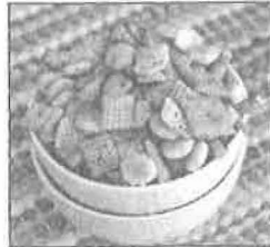
FOR MORE GREAT RECIPES: WWW.JULIESEATSANDTREATS.COM

(if you want it more mild start with 1/8 c.)