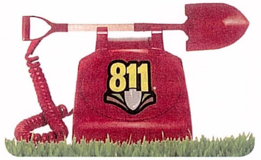
ALWAYS CALL BEFORE YOU DIG