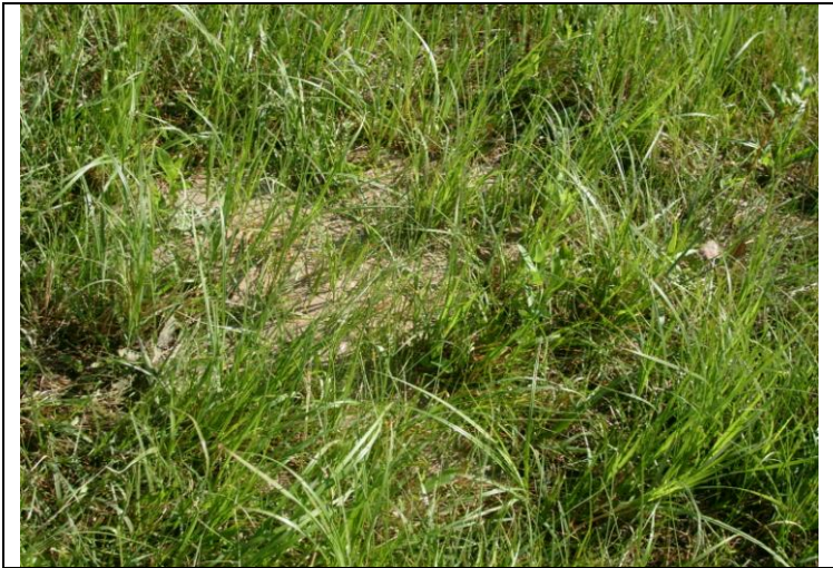
Frac-out in the vicinity of Station 367+75.