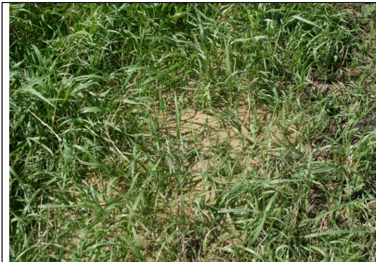
Frac-out in the vicinity of Station 368+50.