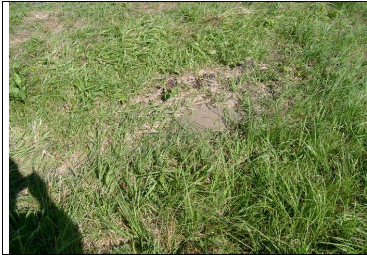
Frac-out in the vicinity of Station 366+00.