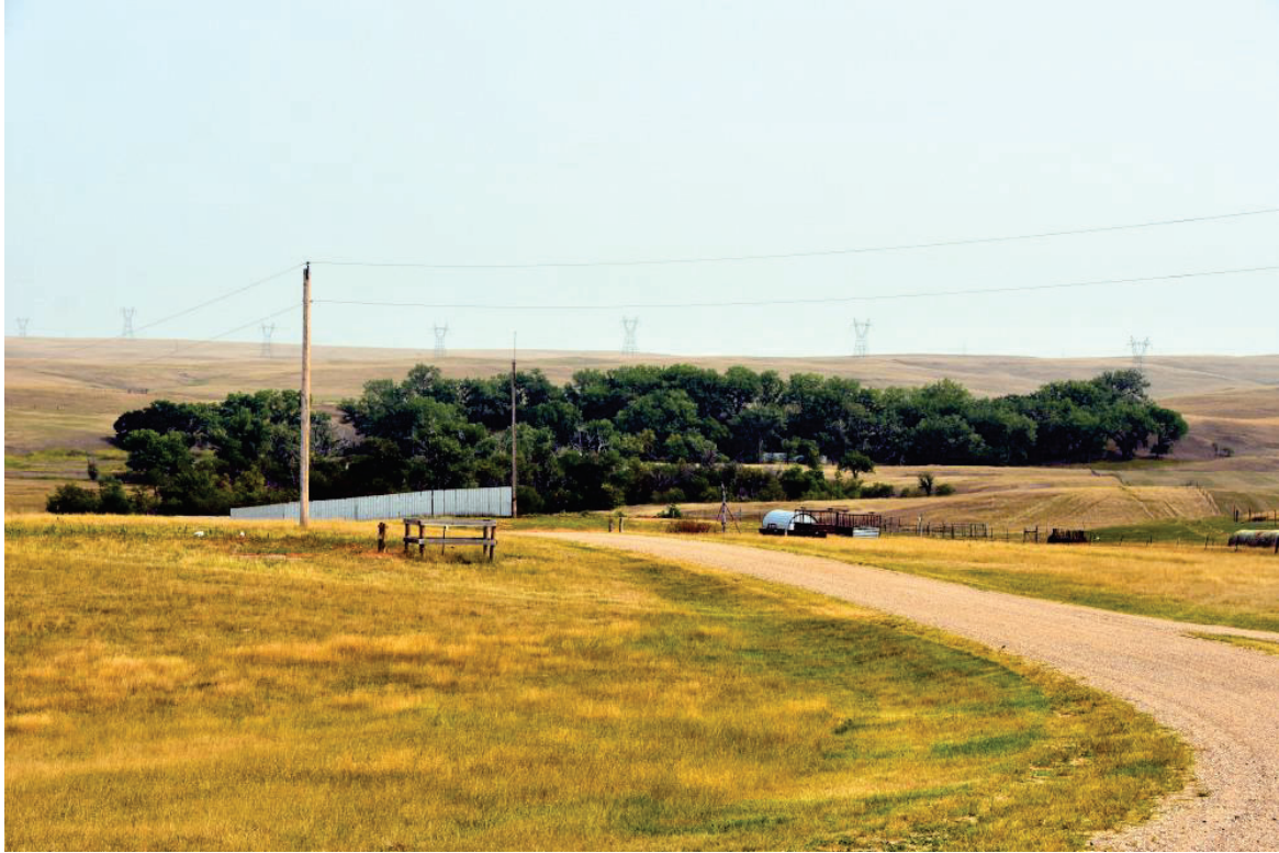
Representative photograph of northern long-eared bat potentially suitable summer habitat at Site