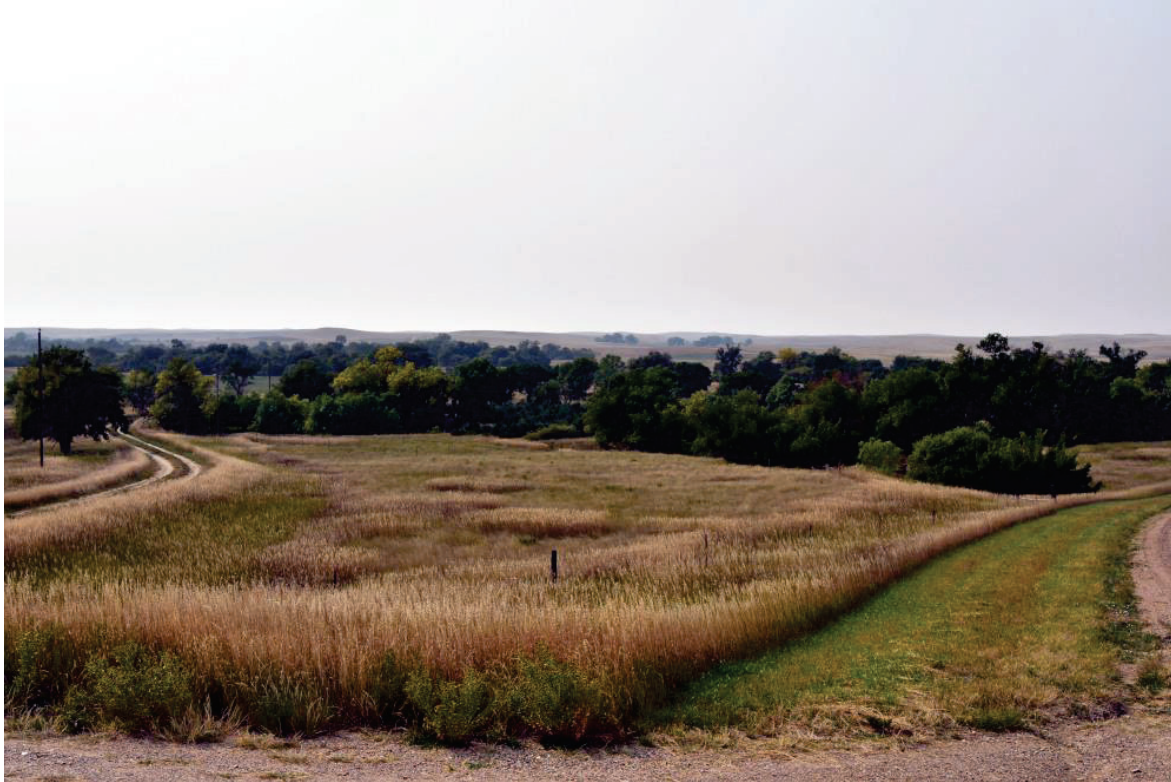
Representative photograph of northern long-eared bat potentially suitable summer habitat and