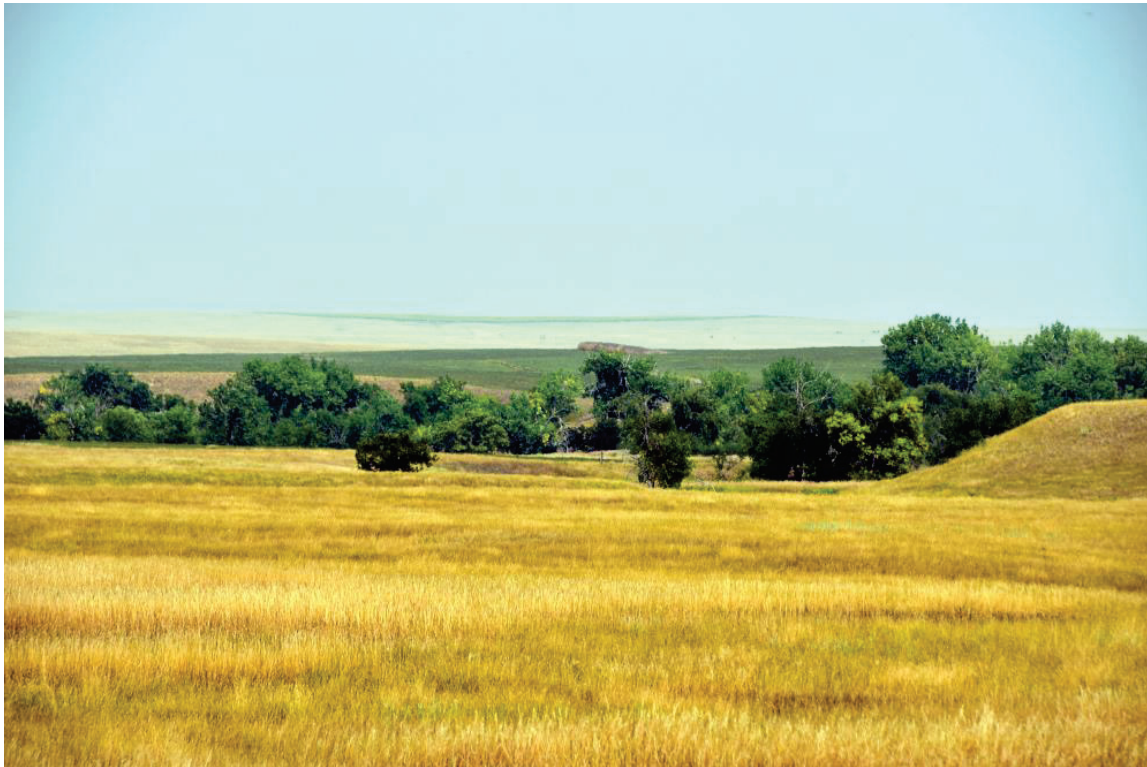
Representative photograph of northern long-eared bat potentially suitable summer habitat and