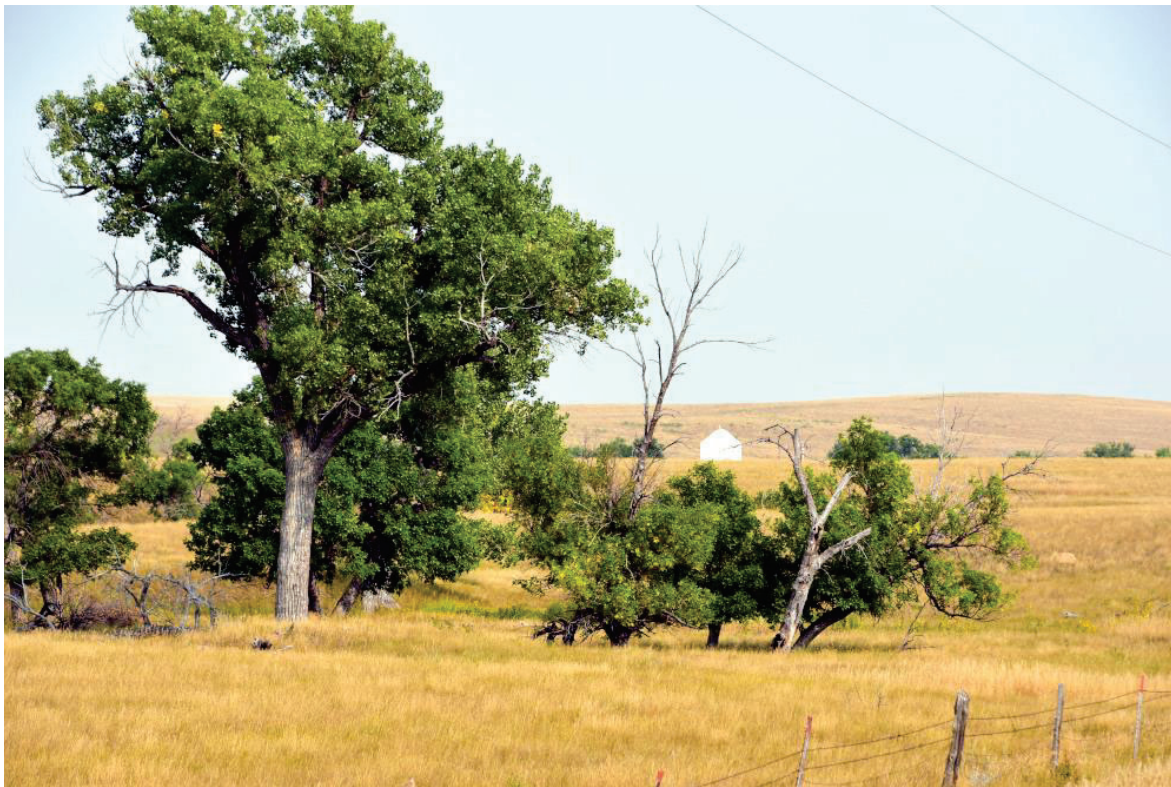
Representative photograph of trees and snags with exfoliating bark at Site 3.