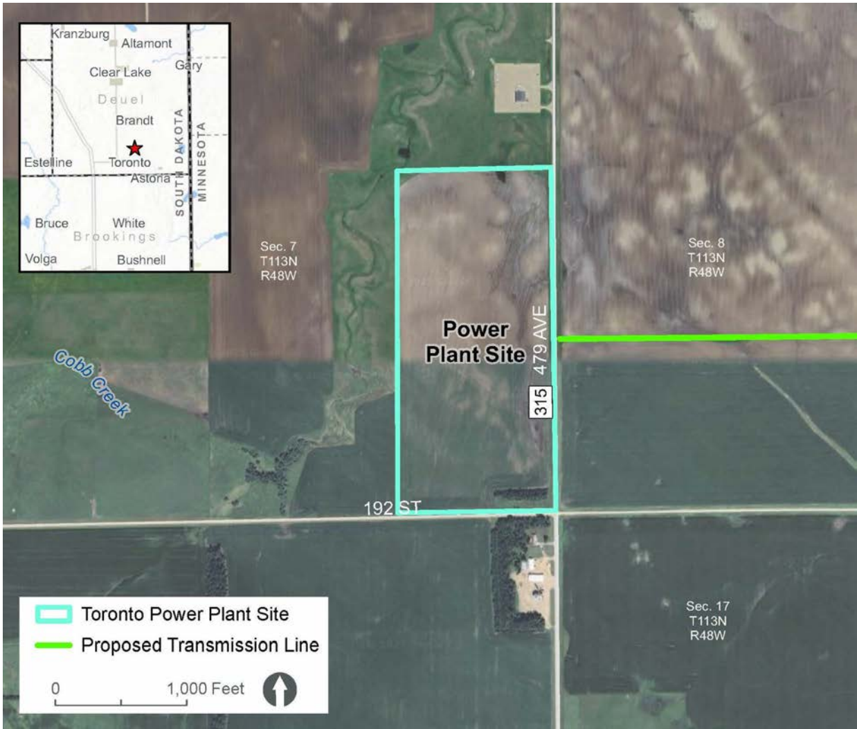
Figure 1. Power Plant Site