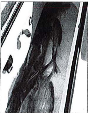
Dropping water temperatures have stalled the spawn and dented the bite a bit for walleyes on the Missouri River, but anglers using jigs and minnows are still finding success.