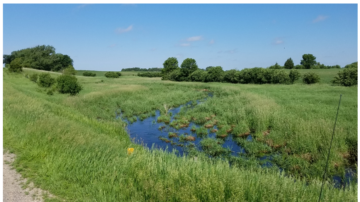
Figure 2a. Photo from site visit (June 14) at the location of proposed Structure 29 (intersection of 191<sup>st</sup> Street and 486<sup>th</sup> Avenue) of Bitter Root Wind transmission route (September 2018) in Deuel County, South Dakota. Site had heavy invasions of Tier 1 invasive species, including reed-canary grass, smooth brome, and green ash trees on the margins; no Tier 1 native species were observed.