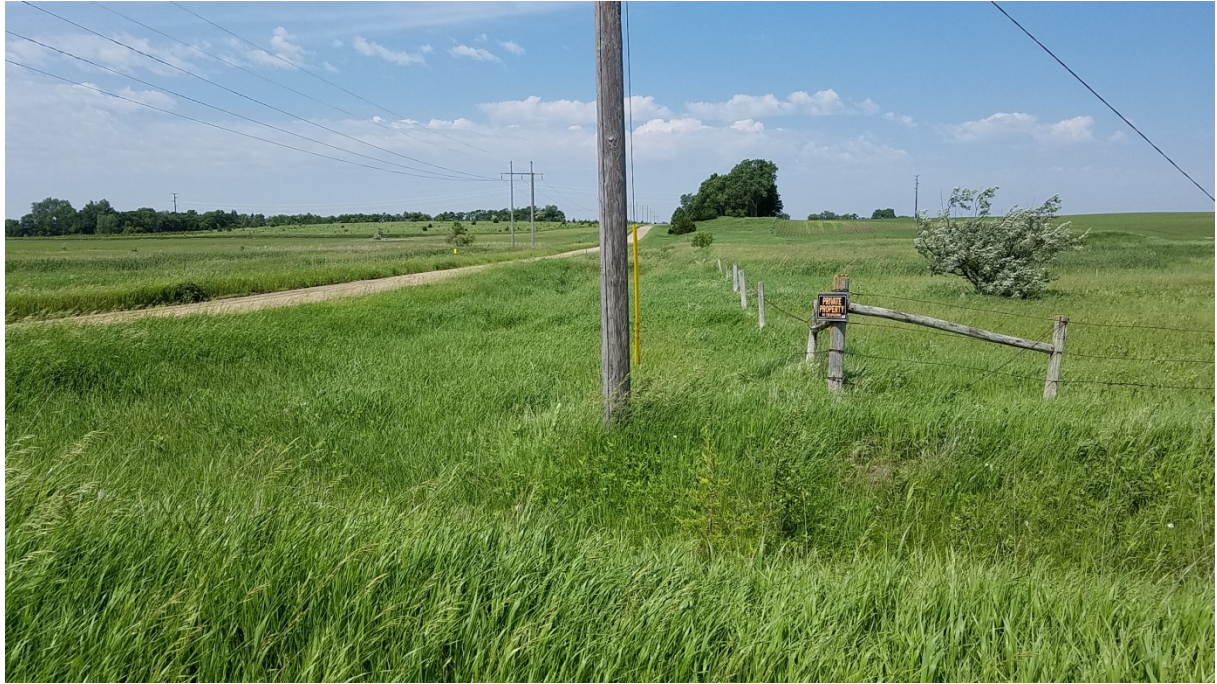
Figure 2b. Photo from site visit (June 14) at the location of Structure 77 (intersection of 193<sup>rd</sup> Street and 482<sup>nd</sup> Avenue) of Bitter Root Wind transmission route (September 2018) in Deuel County, South Dakota. Site had heavy invasions of Tier 1 invasive species, including smooth brome, Kentucky bluegrass, and Canada thistle, with Russian olive ( Elaeagnus angustifolia ) in the background; no Tier 1 native species were observed.

Figure 2a. Photo from site visit (June 14) at the location of proposed Structure 29 (intersection of 191<sup>st</sup> Street and 486<sup>th</sup> Avenue) of Bitter Root Wind transmission route (September 2018) in Deuel County, South Dakota. Site had heavy invasions of Tier 1 invasive species, including reed-canary grass, smooth brome, and green ash trees on the margins; no Tier 1 native species were observed.