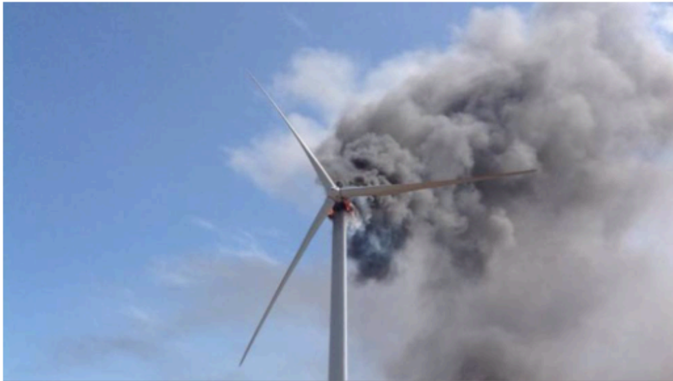
A wind turbine caught fire two miles south of Weatherford March 28, sparking a grass fire.