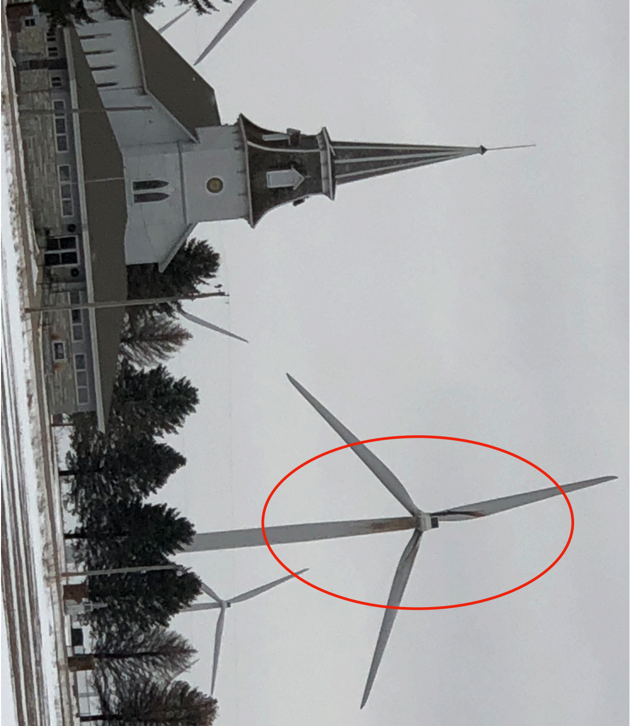
Near Kensett, IA, 12/23/18