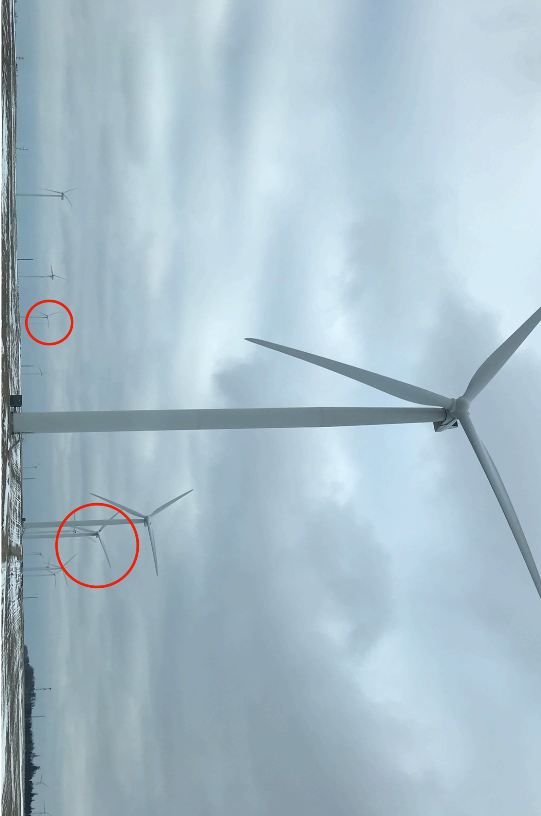
Near Kensett, IA, 12/23/18