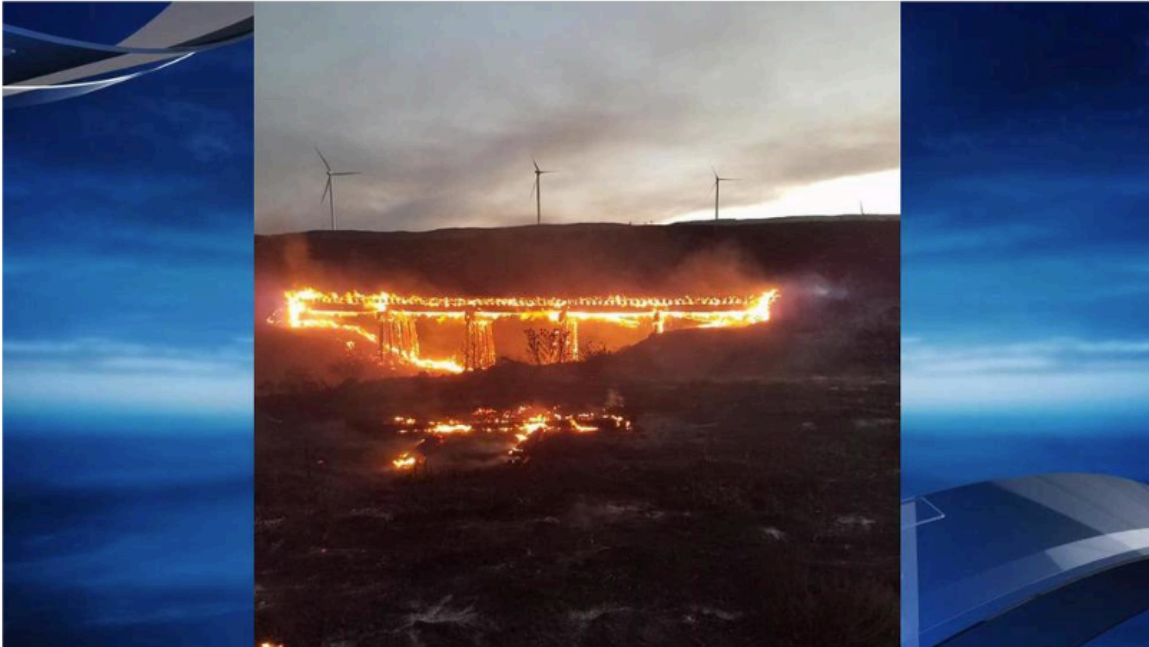
A railroad bridge burns Thursday night, Aug. 2, 2018 in Arlington, Oregon. Firefighters said a wind turbine caught fire, sparking a blaze.

by KATU.com Staff | Friday, August 3rd 2018