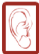
Hearing and vibrotactile thresholds as measured for hearing and deaf subjects by Landström et al. (1983).