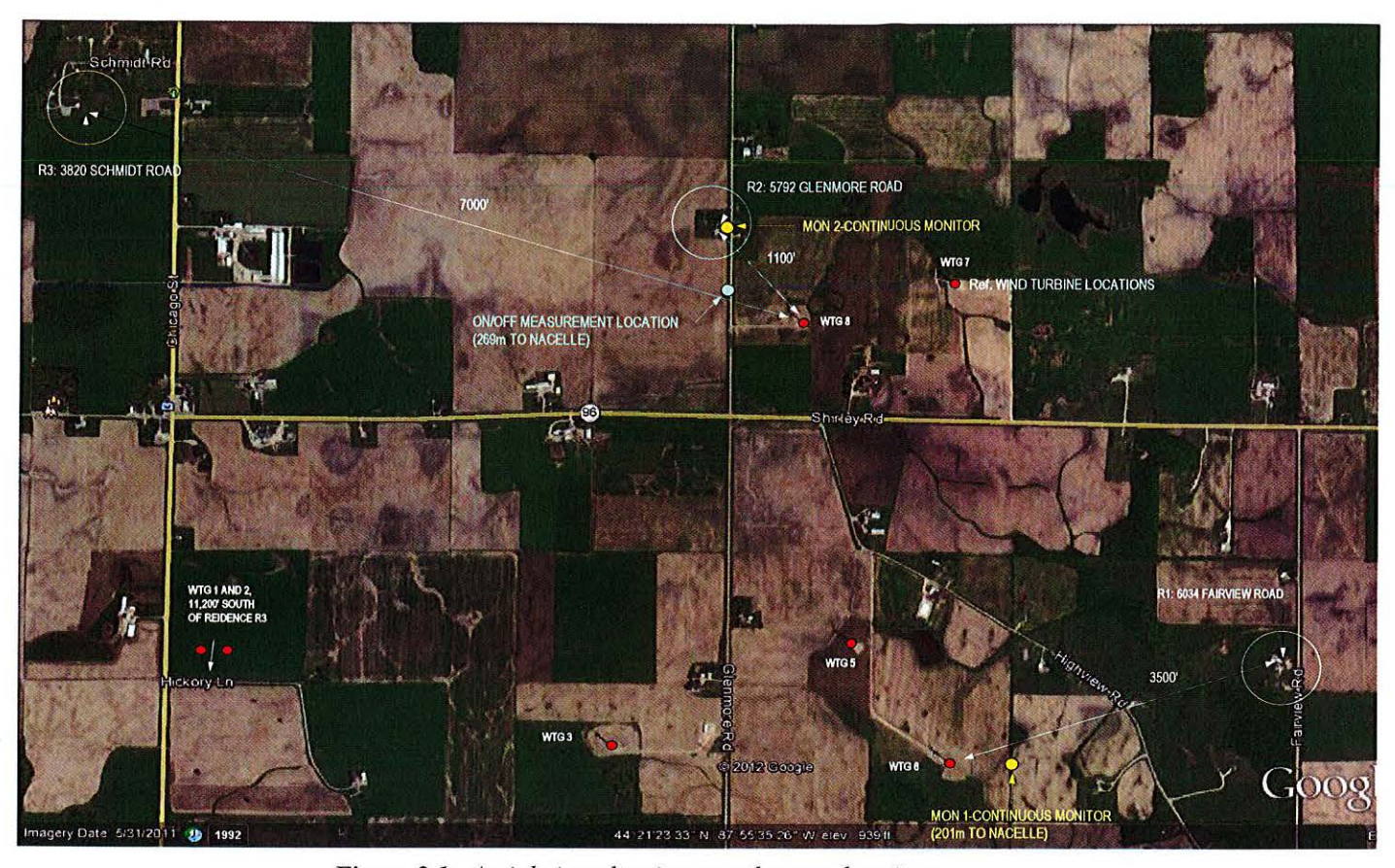
Figure 2.1: Aerial view showing sound survey locations

The four firms wish to thank and acknowledge the extraordinary cooperation given to us by the residence owners and various attorneys.