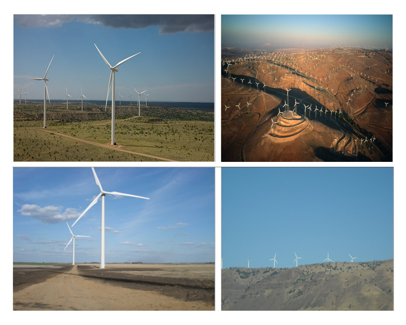
Figure 2. Photographic images of sites illustrating onshore landscapes where industrial wind turbines expose humans to minimal health risks due to large setback distances. Note that homes are not seen in the photos. (Source: https://images.search.yahoo.com/search/images?p=wind+turbine+images+california&fr=tightropetb&imgurl=http%3A%2F% 2Fwww.freefoto.com%2Fimages%2F39%2F01%2F39_01_1---Wind-Turbine-Generators--Palm-Springs--California_web.jpg#id=36&iurl=http%3A%2F%2Fmedia-cdn.tripadvisor.com%2Fmedia%2Fphoto-s%2F01%2F70%2Ff9%2Fbb%2Ftehachepi-area-california_jpg&action=close).

residential and other populations, especially vulnerable populations, that are or likely to be negatively affected.