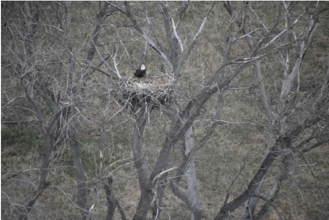
Appendix A4. Nest 1741 was located approximately 4.06 mi (6.53 km) southwest of the Crocker Wind Farm boundary. The nest was in good condition. One adult bald eagle was incubating on the nest. The nest is therefore considered occupied and active in 2017.