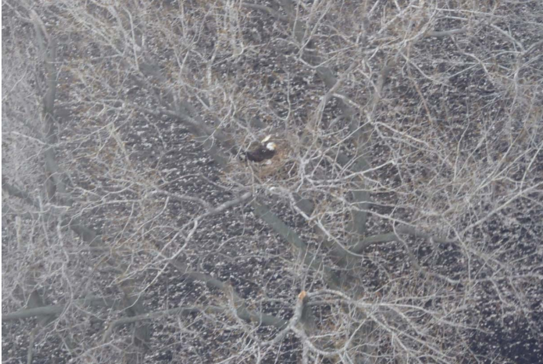
Appendix A1. Nest 1717 was located approximately 9.23 mi (14.85 km) southeast of the Crocker Wind Farm boundary. The nest was in good condition. One adult bald eagle was incubating on the nest. The nest is therefore considered occupied and active in 2017.