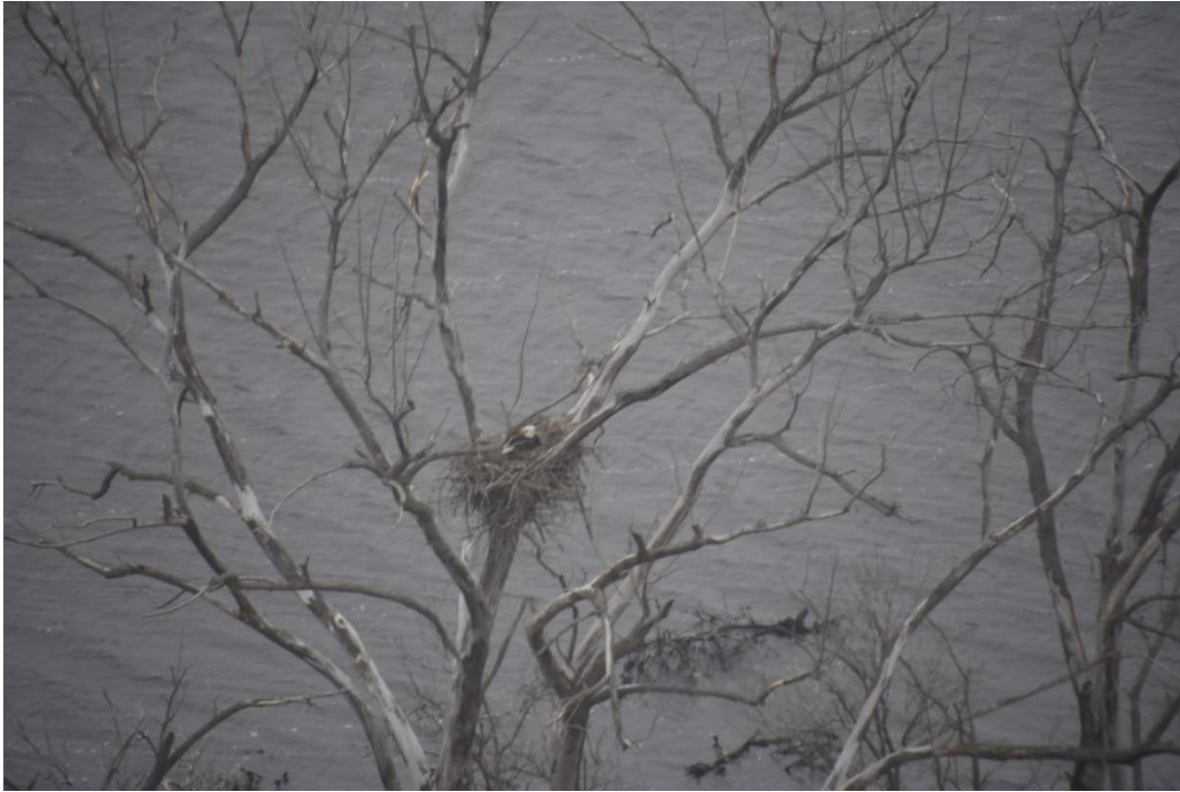
Appendix A3. Nest 1740 was located approximately 3.18 mi (5.12 km) north of the Crocker Wind Farm boundary. The nest was in good condition. One adult bald eagle was incubating on the nest. The nest is therefore considered occupied and active in 2017.