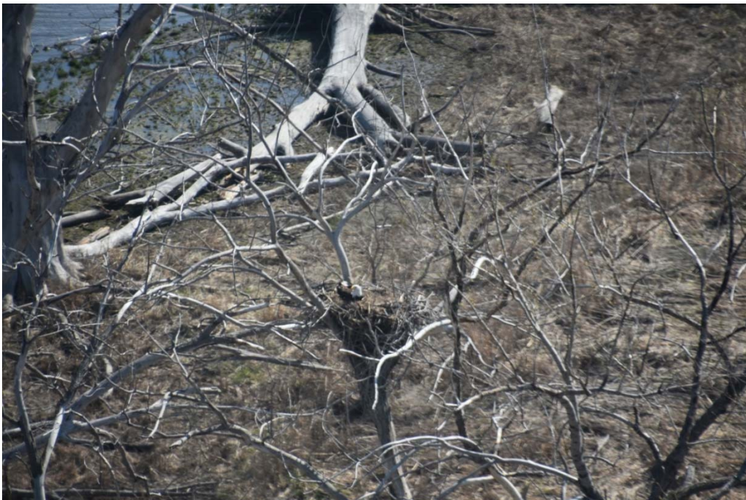
Appendix A2. Nest 1718 was located approximately 5.28 mi (8.50 km) east of the Crocker Wind Farm boundary. The nest was in good condition. One adult bald eagle was incubating on the nest. The nest is therefore considered occupied and active in 2017.