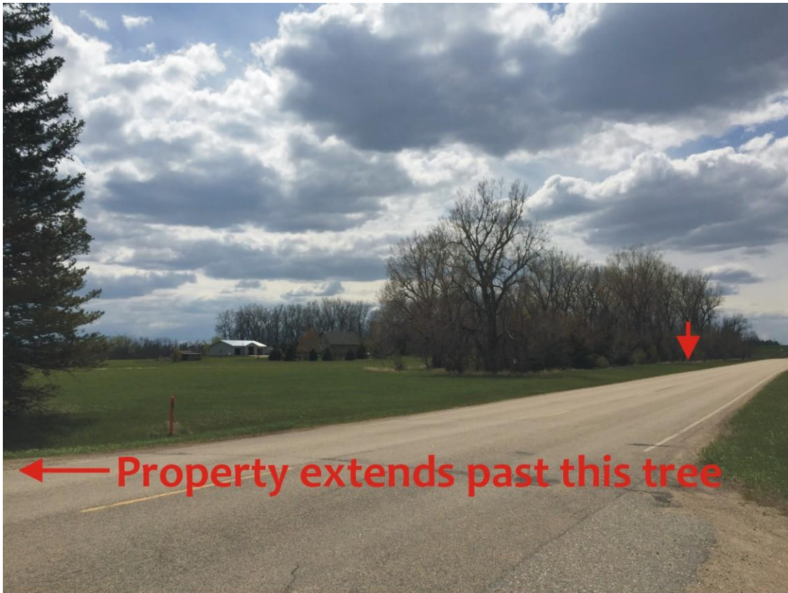
Christenson northern property line

of the tree line, as far away from the trees as possible. I am also attaching to this Motion, the graphs of submitted to the Commission showing the noise levels on the days most affected by the turbine noise. You will notice the sound on the Christenson property (Location 6) was consistently louder than other studied properties. If you would kindly refer back to the entire study's contents, you will see the Christenson property sound levels were very high as compared to other properties, I contend the tree noise skewed the results of the study considerably.