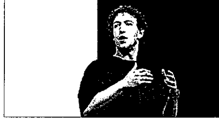
Mark Zuckerberg talks about the Orion AR glasses during the Meta Connect conference in Menlo Park, California.

Meta is among several tech companies reportedly working to get in Trump's good graces before he takes office later this month. Meta and Amazon each donated $1 million to Trump's inauguration fund in December, and Zuckerberg had dinner