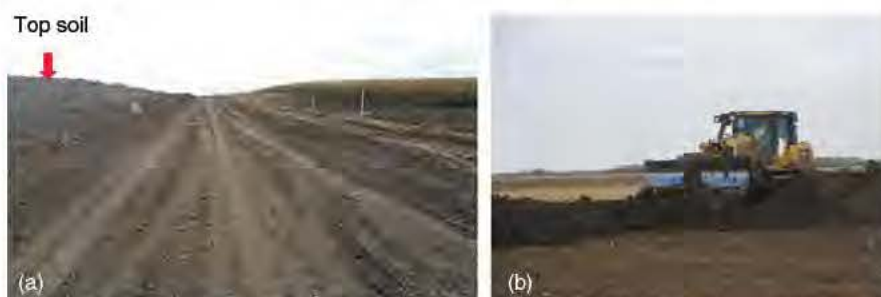
FIGURE 1 (a) Topsoil pile adjacent to the ROW zones. (b) The top soil was replaced by a Caterpillar D7E bulldozer after the exposed subsoil was tilled. The Caterpillar D7E fully loaded weight was 256 kN. Each track had a nominal track contact length of 3.02 m and a width of 0.76 m (Tekeste et al., 2019) [Colour figure can be viewed at wileyonlinelibrary.com ]

Soybean (2017) and corn (2018) were planted on 760 mm row-spacing using an 8-row John Deere Max Emerge 5 Planter model pulled by a John Deere 6170R MFWD. Planting was performed parallel to the pipeline. Yield from the centre four rows of each plot, conventional and no-till sections, was combine harvested using the on-board Harvestmaster system