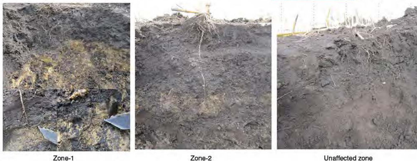
FIGURE 7 Visual observation of the soil structure from Zone 1, Zone 2 and the unaffected zone. A trench approximately 1 m wide by 2 m deep was excavated. Soil structure and root distribution were observed on the exposed trench face. The trench was on the DAPL pipeline, and it was located approximately 1.6 km east of the experimental plots [Colour figure can be viewed at wileyonlinelibrary.com ]