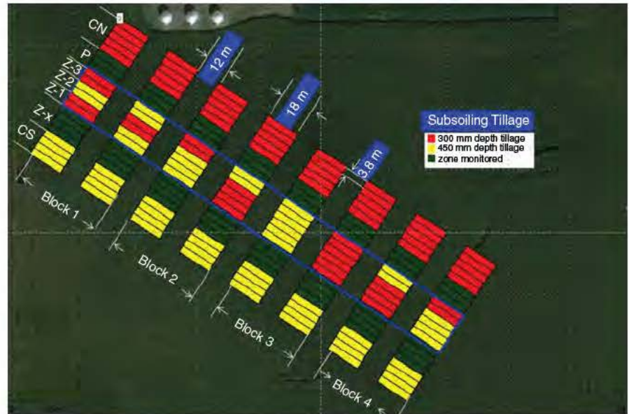
FIGURE 3 Based on the randomized complete block design (RCBD), the 300-mm- and 450-mm-deep tillage treatments were applied within Zone-1, Zone-2 and Zone-3 prior to topsoil replacement ("blue" rectangle). Each subsoil tillage plot size was 7.6 m width by 18 m long. Within the right-of-way (ROW), Zone-x and Zone-P (topsoil pile zone) were not part of the RCBD tillage experiment design. Crop field zones (Control-N, CN (north) and Control-S, CS (south)) were outside the ROW and unaffected by the pipeline construction [Colour figure can be viewed at wileyonlinelibrary.com ]

760 mm spacing with DMI ripper points, 63.5-mm-wing width) was used to apply the subsoil tillage operation.