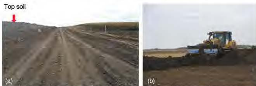
FIGURE 1 (a) Topsoil pile adjacent to the ROW zones. (b) The top soil was replaced by a Caterpillar D7E bulldozer after the exposed subsoil was tilled. The Caterpillar D7E fully loaded weight was 256 kN. Each track had a nominal track contact length of 3.02 m and a width of 0.76 m (Tekeste et al., 2019) [Colour figure can be viewed at wileyonlinelibrary.com ]

Soybean (2017) and corn (2018) were planted on 760 mm row-spacing using an 8-row John Deere Max Emerge 5 Planter model pulled by a John Deere 6170R MFWD. Planting was performed parallel to the pipeline. Yield from the centre four rows of each plot, conventional and no-till sections, was combine harvested using the on-board Harvestmaster system