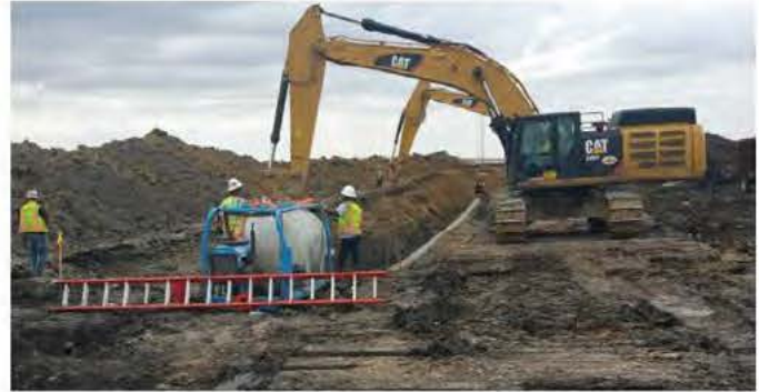
Caterpillar 349F hydraulic excavator. Fully loaded weight = 522 kN. Each track had a nominal track contact length of 5.36 m long and a width of a 0.76 m.