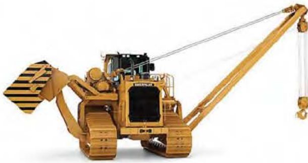
Caterpillar pipe liner PL 87. Fully loaded weight = 475 kN. Each track dimension had a nominal track contact length, which is the length of track in contact with a flat, unyielding surface (ISTVS, 1977), of 3.71 m and a width of 0.76 m.