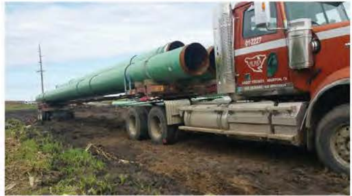
Semi-trailer truck with three pipes (each pipe was 24.4 m long, 0.76 m outer diameter, and 9.5 mm wall thickness).