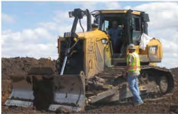
Caterpillar D7E bulldozer. Fully loaded weight = 256 kN. Each track had a nominal track contact length of 3.02 m and a width of 0.76 m.