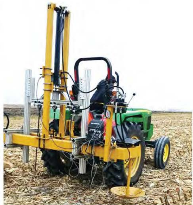
FIGURE 4 Three-probe cone penetrometer mounted on the three-point hitch of a tractor. The lateral spacing between the penetrometer probes was 150 mm during field measurements. An ASABE 30-degree conical tip with 285 mm 2 cone base area was attached to each of the probes. The probe insertion rate was 30 mm s -1 [Colour figure can be viewed at wileyonlinelibrary.com ]

After the first year crop harvest in fall 2017, soil cone penetration resistance was measured according to the ASABE standards (ASAE Standards, 2004a,b). A tractor-mounted three-probe cone penetrometer designed and built at ISU (Figure 4) was used to measure the soil cone penetration resistance. Cone penetration resistance force was measured using a Transducer Techniques model LPU-500 load cell transducer with 2224-N capacity (Transducer Techniques,