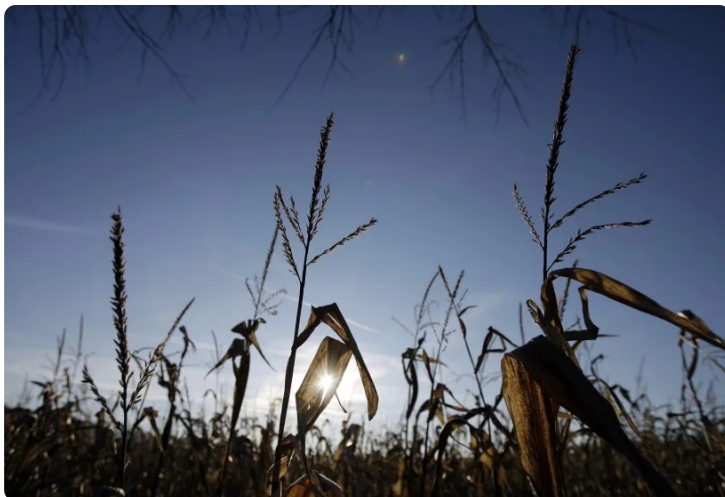
Using more fertilizer to raise more corn to produce more ethanol is not a solution.

As California prepares to update its low carbon fuel standard — a policy aiming to reduce emissions from transportation fuels — Indigenous groups and environmentalists across the Midwest are fighting one of its key provisions. The policy would incentivize ethanol production through technology that stores carbon underground not just in California, but anywhere in the U.S.