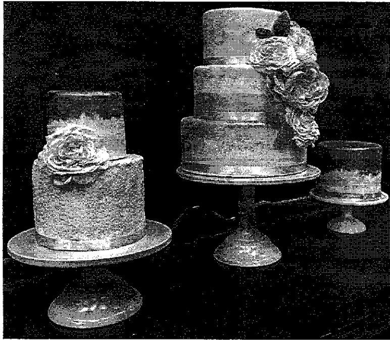
Cakes decorate the space of Austin's new location, showcasing her talent and artistry.