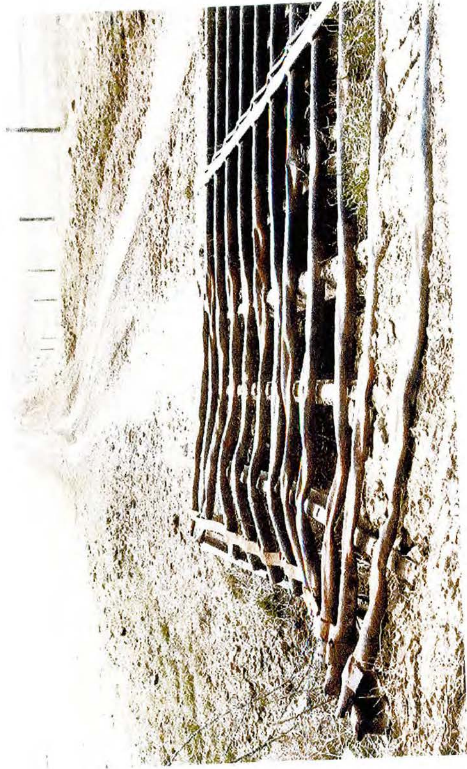
A cattleguard damaged during installation of the Bison high pressure gas pipeline in southeast Montana 04/12/2011