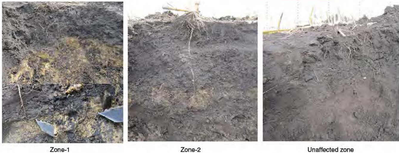
FIGURE 7 Visual observation of the soil structure from Zone 1, Zone 2 and the unaffected zone. A trench approximately 1 m wide by 2 m deep was excavated. Soil structure and root distribution were observed on the exposed trench face. The trench was on the DAPL pipeline, and it was located approximately 1.6 km east of the experimental plots [Colour figure can be viewed at wileyonlinelibrary.com ]