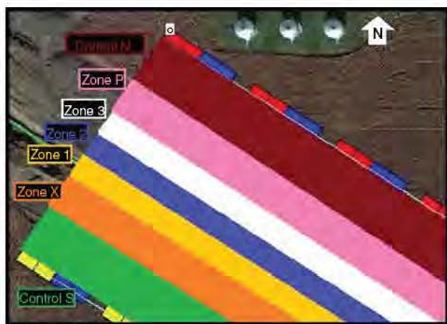
FIGURE 2 Map of experimental research plot showing the designated construction zones (Zone-1, Zone-2, Zone-3 and Zone-x) and unaffected crop field zones (Control-S and Control-N) aligned in reference to the pipeline. Zone-P refers to where the topsoil was piled Colour figure can be viewed at wileyonlinelibrary.com

Soil stresses were measured prior to the topsoil replacement to quantify the impact of loading from the high axle vehicle trafficking on deep induced soil stresses. Within Z-x, vehicle induced peak vertical soil stresses were measured at three soil depths using a GEOKON model 3500, 1 MPa capacity,