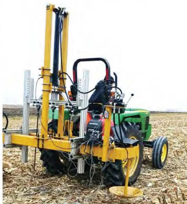
FIGURE 4 Three-probe cone penetrometer mounted on the three-point hitch of a tractor. The lateral spacing between the penetrometer probes was 150 mm during field measurements. An ASABE 30-degree conical tip with 285 mm 2 cone base area was attached to each of the probes. The probe insertion rate was 30 mm s -1 [Colour figure can be viewed at wileyonlinelibrary.com ]

After the first year crop harvest in fall 2017, soil cone penetration resistance was measured according to the ASABE standards (ASAE Standards, 2004a,b). A tractor-mounted three-probe cone penetrometer designed and built at ISU (Figure 4) was used to measure the soil cone penetration resistance. Cone penetration resistance force was measured using a Transducer Techniques model LPU-500 load cell transducer with 2224-N capacity (Transducer Techniques,