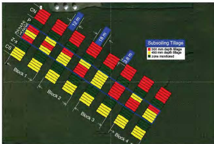
FIGURE 3 Based on the randomized complete block design (RCBD), the 300-mm- and 450-mm-deep tillage treatments were applied within Zone-1, Zone-2 and Zone-3 prior to topsoil replacement (“blue” rectangle). Each subsoil tillage plot size was 7.6 m width by 18 m long. Within the right-of-way (ROW), Zone-x and Zone-P (topsoil pile zone) were not part of the RCBD tillage experiment design. Crop field zones (Control-N, CN (north) and Control-S, CS (south)) were outside the ROW and unaffected by the pipeline construction [Colour figure can be viewed at wileyonlinelibrary.com ]

760 mm spacing with DMI ripper points, 63.5-mm-wing width) was used to apply the subsoil tillage operation.