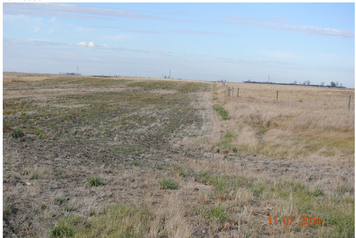
\#8 \sim 0087 \sim \text{Native grasses} on the right side of the easement area