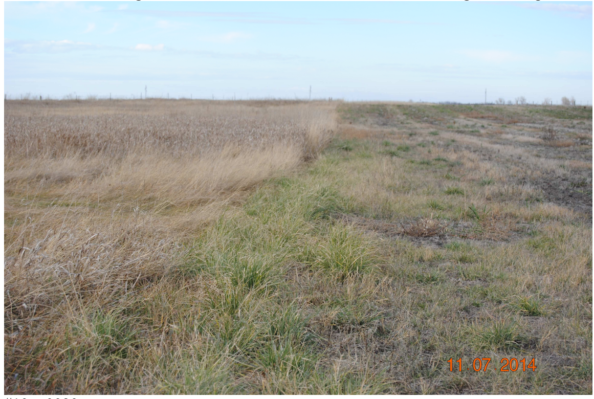
#10 ~ 0090