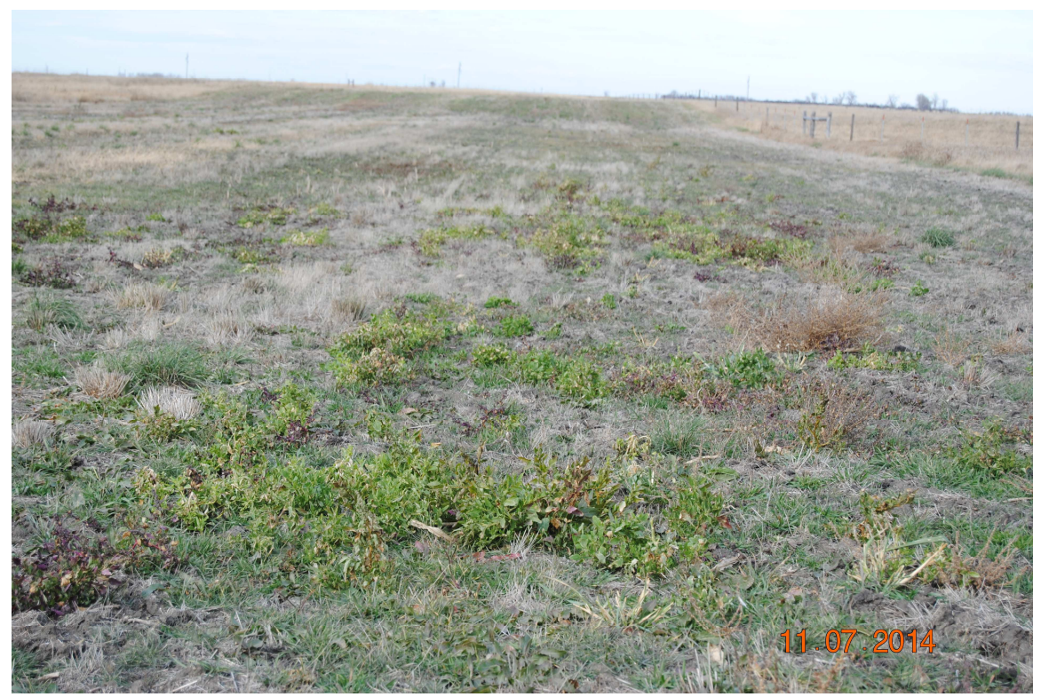
#7 ~ 0086