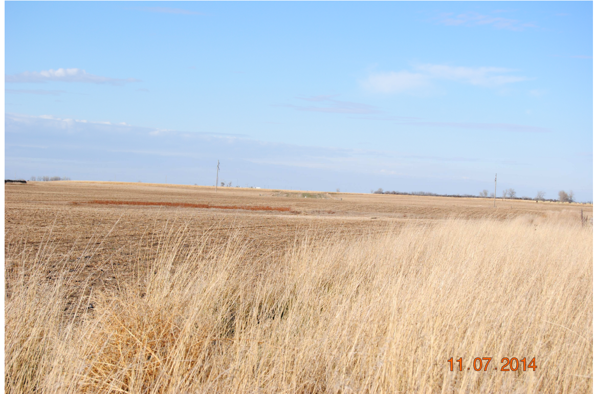
\#18 \sim 0113 \sim Easement area in the middle of the picture, where sky and land meet.