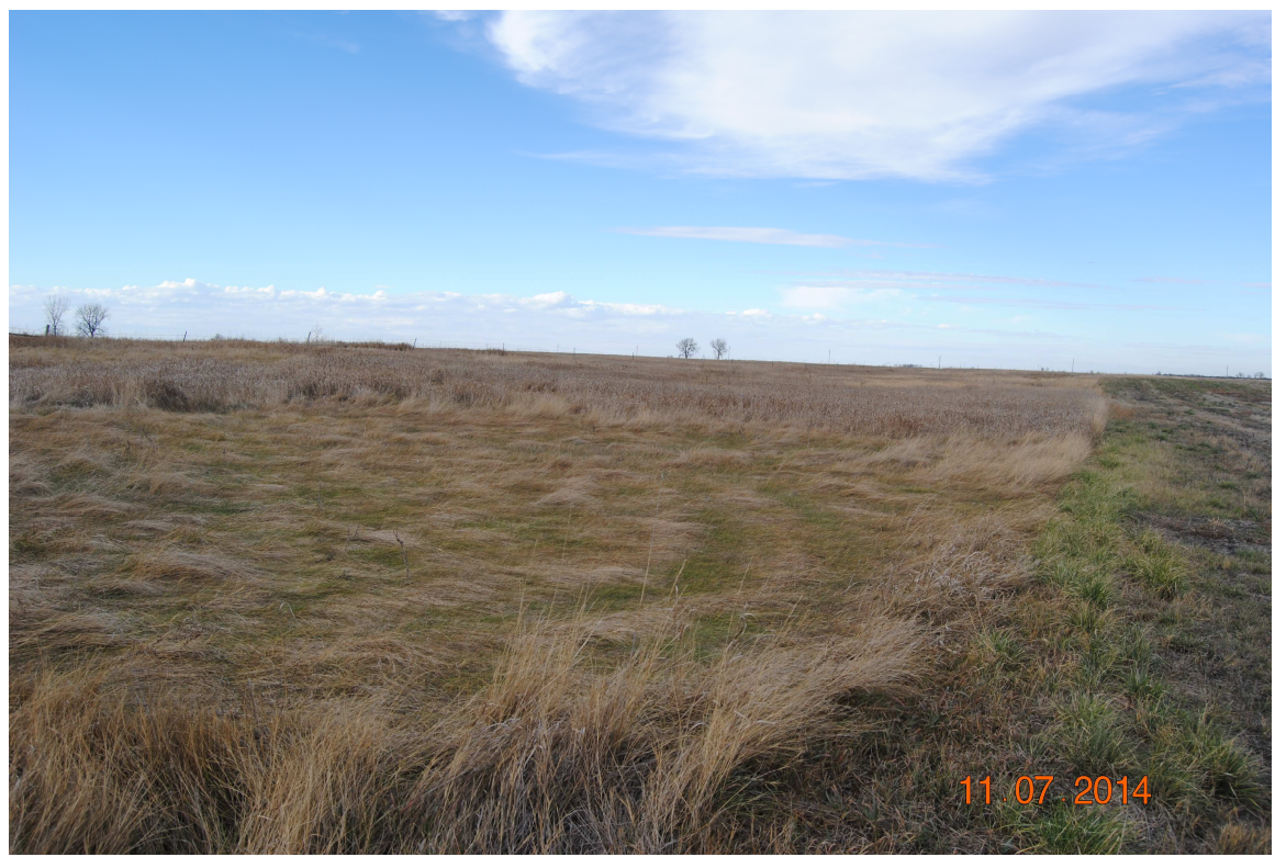
\#11 \sim 0095 \sim \text{Native grasses} on the left side of picture