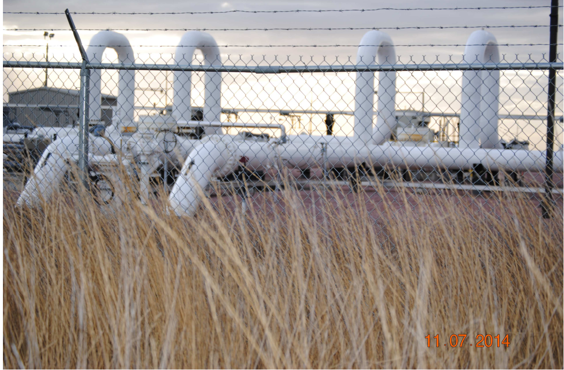
#30 \sim 0165 \sim \text{Pump Station north of the Sibson property}

#29 \sim 0159 \sim Easement area south side of 238<sup>th</sup> St. \sim Looking south