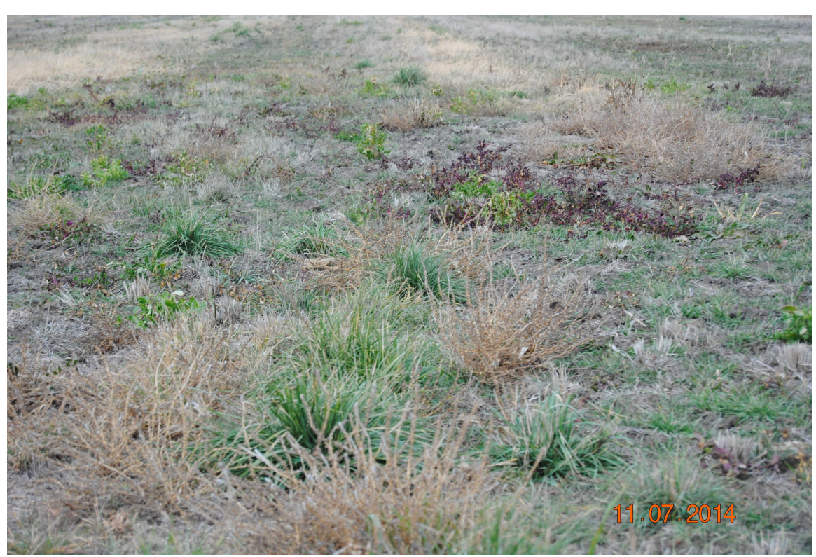
\#2 \sim 0075 \sim \text{Weeds} , tumbleweeds, and twisted clumps of thickspiked wheat grass