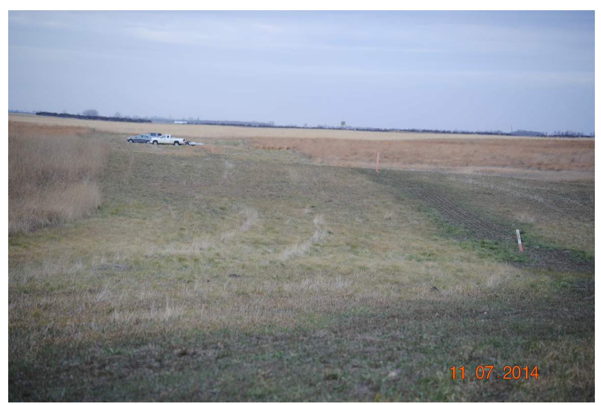
#31 \sim 0172 \sim Easement area on the north side of Pump Station