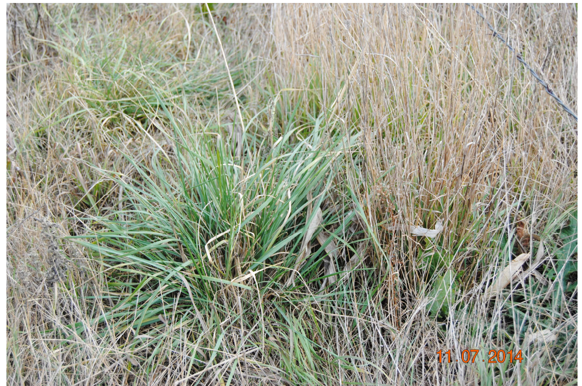
\#5 \sim 0082 and \#6 \sim 0080 \sim Twisted Clumps of thickspiked wheat grass \sim Livestock will not eat.