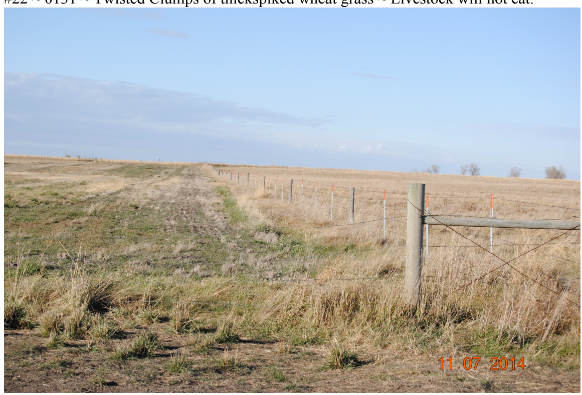
#23 ~ 0134