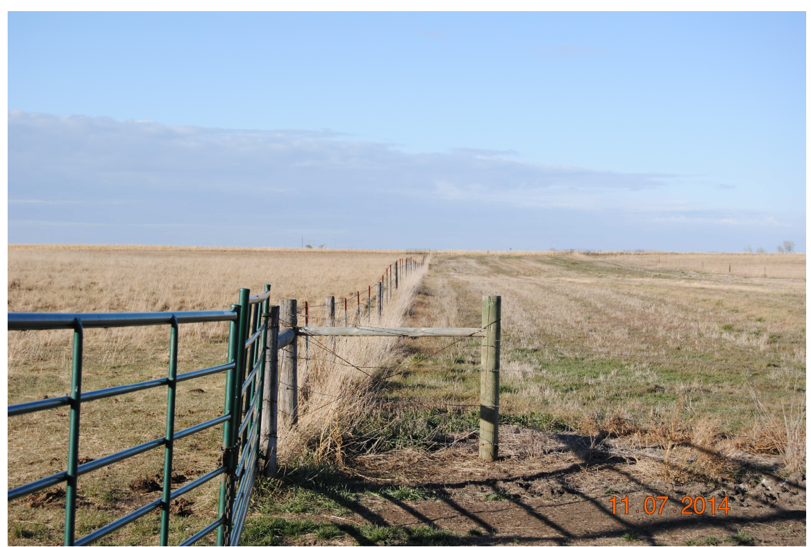
\#24 \sim 0140 \sim Easement area on the right and native grasses on the left