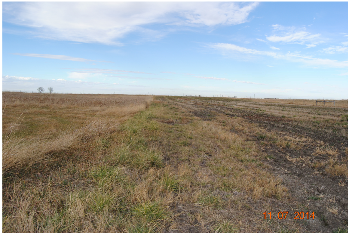
\#9 \sim 0093 \sim \text{Native grasses} on the left side and easement area of the right side of picture