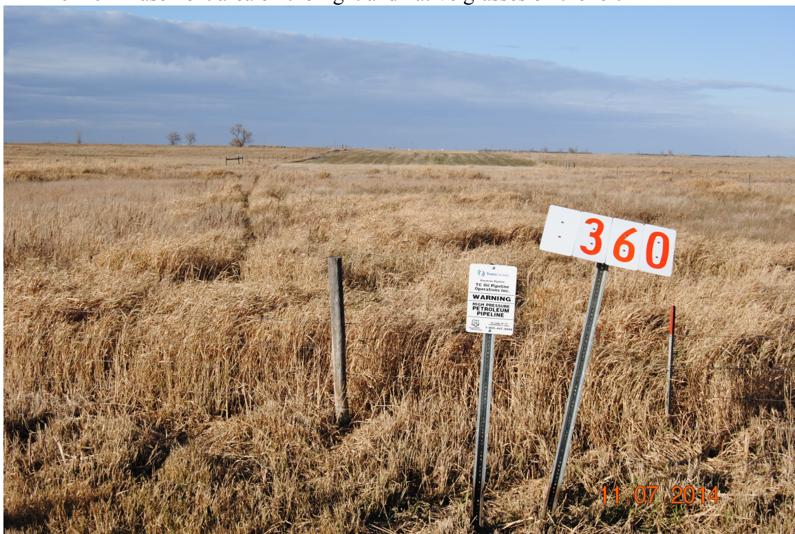
\#25 \sim 0144 \sim \text{Wetlands} \sim \text{Standing on } 238^{\text{th}} \text{ Street} \sim \text{looking north towards easement area}