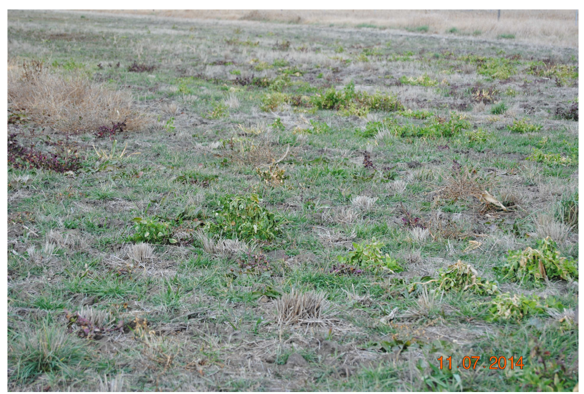
#3 \sim 0077 \sim easement area