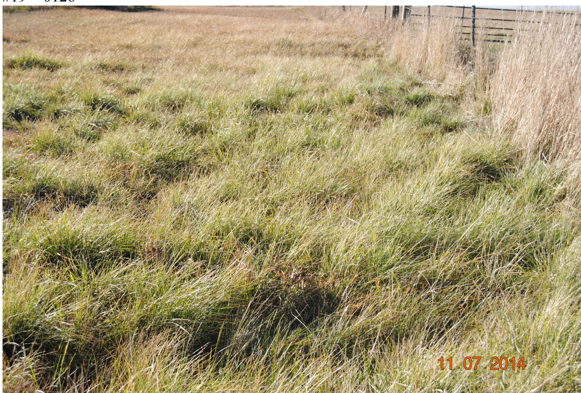
#21 ~ 0129