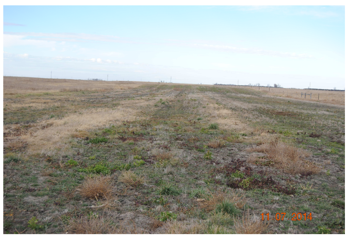
#1 \sim 0074 \sim Easement area