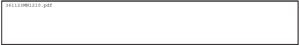
Name of Attached Document

<1210> Terms & Conditions of Voice Telephony Lifeline Plans