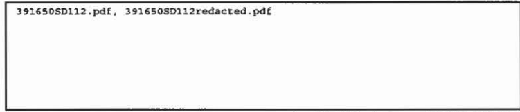
Name of Attached Document

<112> Attach Five-Year Service Quality Improvement Plan or, in subsequent years, your annual progress report filed pursuant to 47 C.F.R. § 54.313(a)(1). If your company is a CETC which only receives frozen support, your progress report is only required to address voice telephony service.