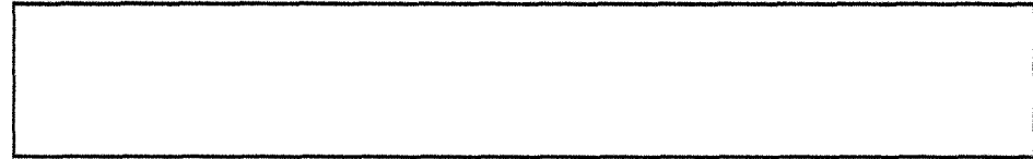
Name of Attached Document

<1210> Terms & Conditions of Voice Telephony Lifeline Plans