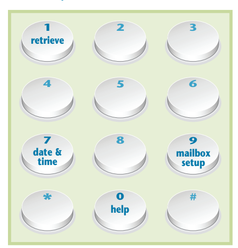
Press 1 to retrieve messages (see page 17) Press 7 to hear current date and time Press 9 for your mailbox setup menu (see page 16)