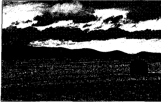
This 2007 file photo provided by South Dakota Magazine shows the nearly 2,000-acre Reynolds Prairie ranch in the Black Hills of South Dakota which encompasses a sacred site known as Pa Ska that the Sioux tribes raised $9 million in 2012 to buy back from a private landowner who had put it up for sale. Protecting sacred sites will be among the topics discussed at a gathering of Sioux tribal leaders beginning today in Rapid City.