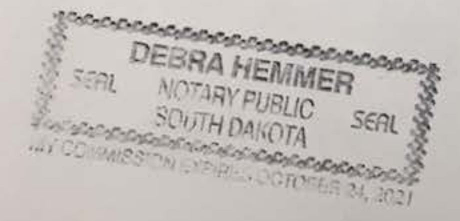
Notary Public, Grant County, South Dakota