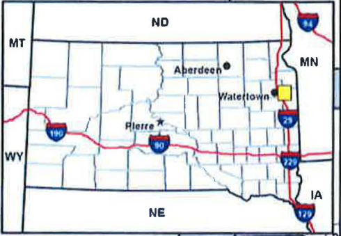
Figure 7. Constraints Map