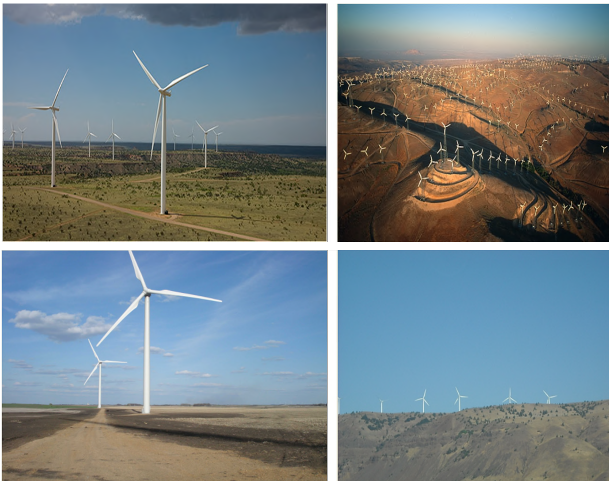
Figure 2. Photographic images of sites illustrating onshore landscapes where industrial wind turbines expose humans to minimal health risks due to large setback distances. Note that homes are not seen in the photos. (Source: https://images.search.yahoo.com/search/images?p=wind+turbine+images+california&fr=tightropetb&imgurl=http%3A%2F%2Fwww.freefoto.com%2Fimages%2F39%2F01%2F39_01_1---Wind-Turbine-Generators--Palm-Springs--California_web.jpg#id=36&iurl=http%3A%2F%2Fmedia-cdn.tripadvisor.com%2Fmedia%2Fphotos%2F01%2F70%2F9%2Fbb%2Ftehachepi-area-california.jpg&action=close ).

residential and other populations, especially vulnerable populations, that are or likely to be negatively affected.