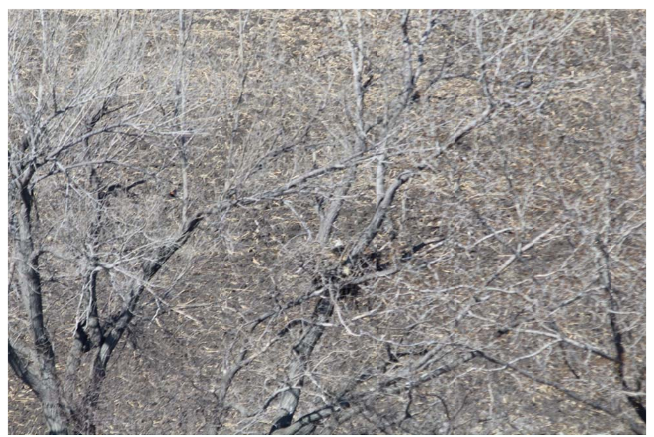
Photo 1. Nest 2 at Crocker Ridge Wind Farm – occupied and active bald eagle nest.