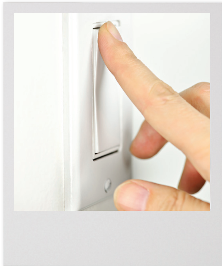
Table of Contents In this guide, you'll find:

Download our free mobile app to easily manage your account and report outages (My Account registration is required). Visit: xcelenergy.com/Mobile_App .