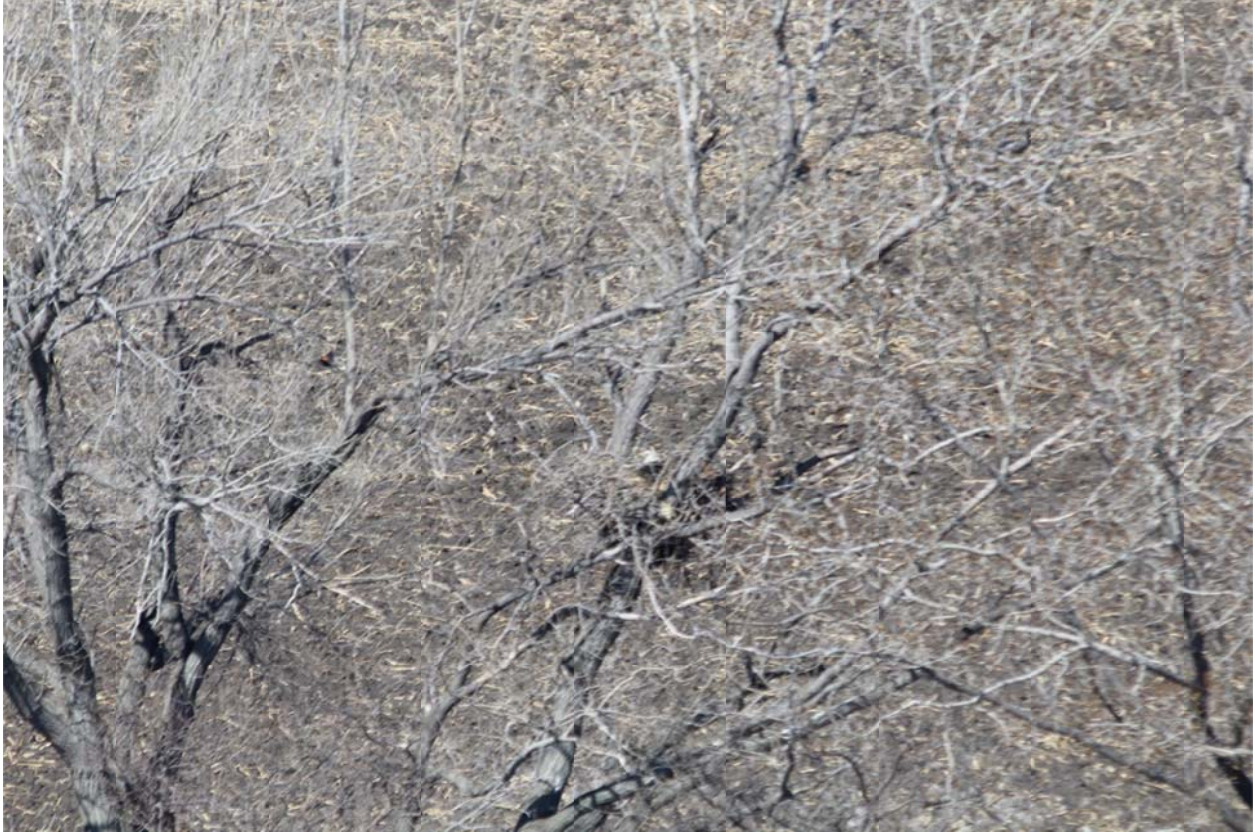
Photo 1. Nest 2 at Crocker Ridge Wind Farm – occupied and active bald eagle nest.