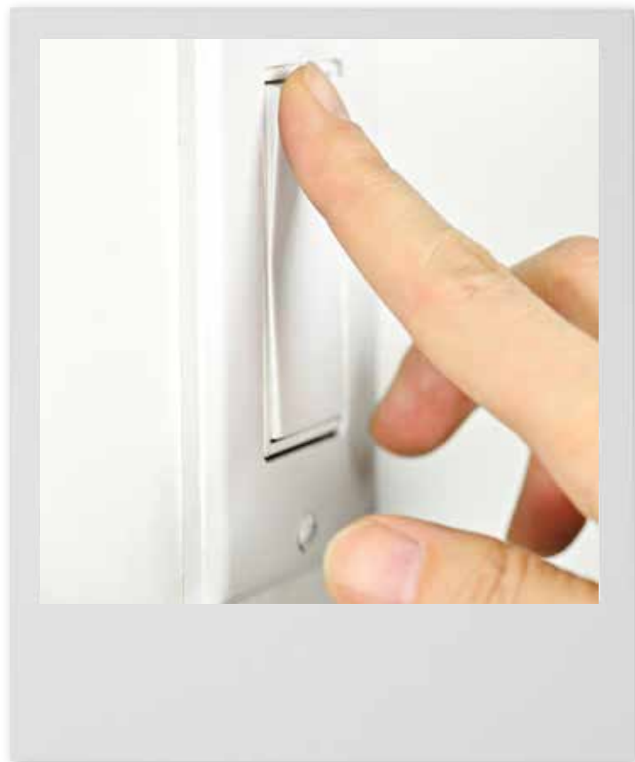
Table of Contents In this guide, you'll find:

Grab your bill and enroll in My Account, our online portal. Visit: xcelenergy.com/MyAccount .