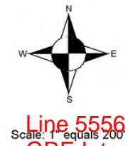
Line 5556 WCK-VIC GRE Interconnection project location map