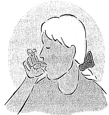
Coal pollution can cause or aggravate lung problems like asthma.

Mercury is a heavy metal and a potent neurotoxin that is emitted from power plants when coal is burned. Mercury is released into the air and settles downwind of power plants where it contaminates lakes, rivers and the fish we eat. Exposure to mercury pollution may be especially harmful to women of child-bearing age, fetuses and children because it interferes with the development of the nervous system and can lead to delayed mental development, learning disabilities, and deficiencies in language, motor function, attention and memory. 5