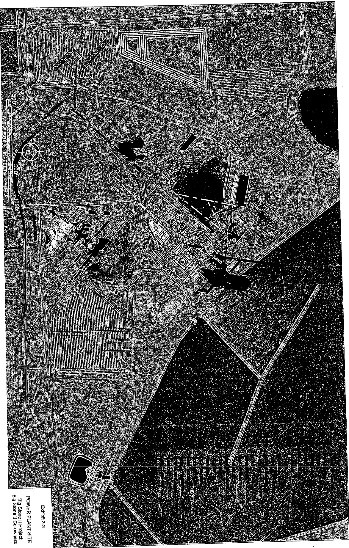
POWER PLANT SITE Big Stone II Project Big Stone II Co-owners