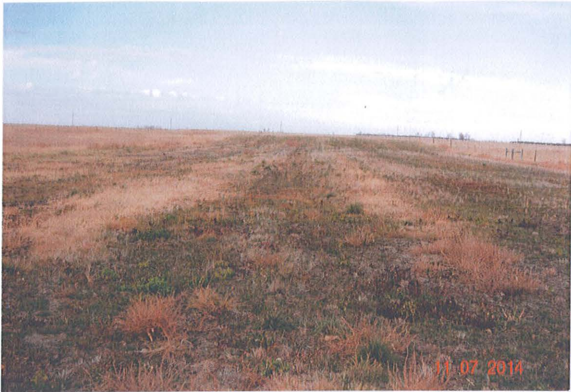
Exhibit D 1-31 ~5006~

#1 0074 Easement area in Exhibit B Spokaneville