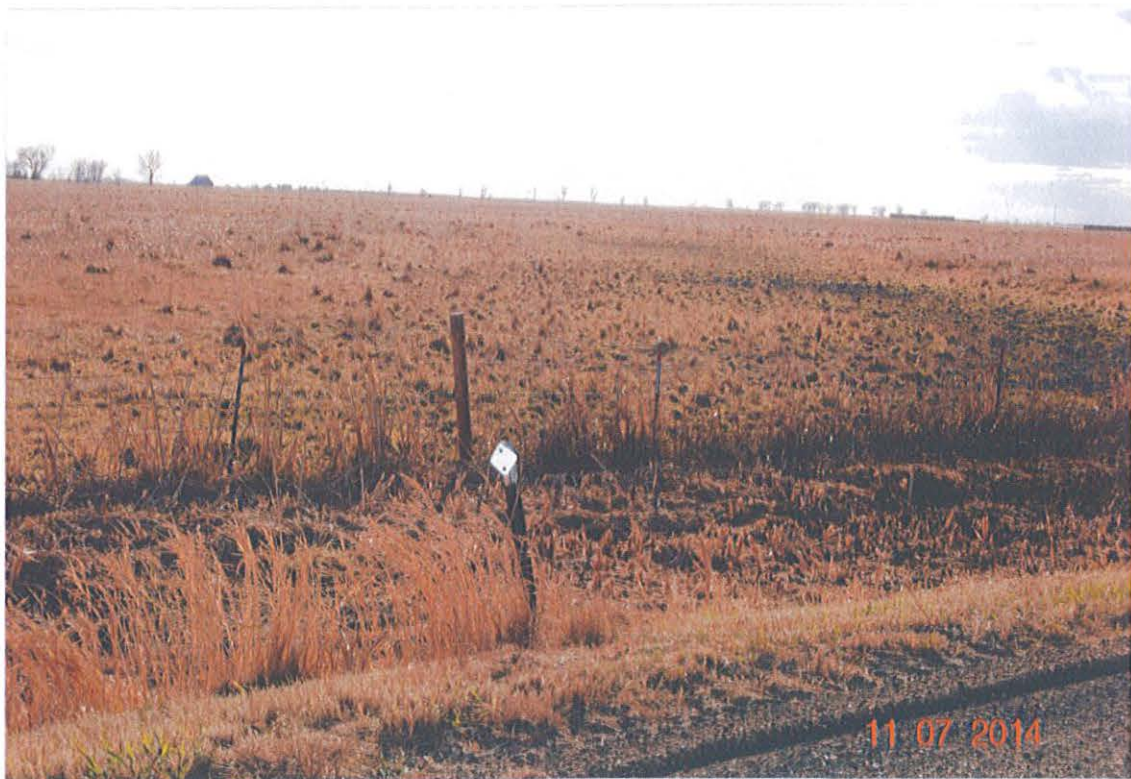
Wetlands ~ Detail "B" easement area ~ Exhibit B. Picture taken ~ Standing on 238 th St. ~ Looking north