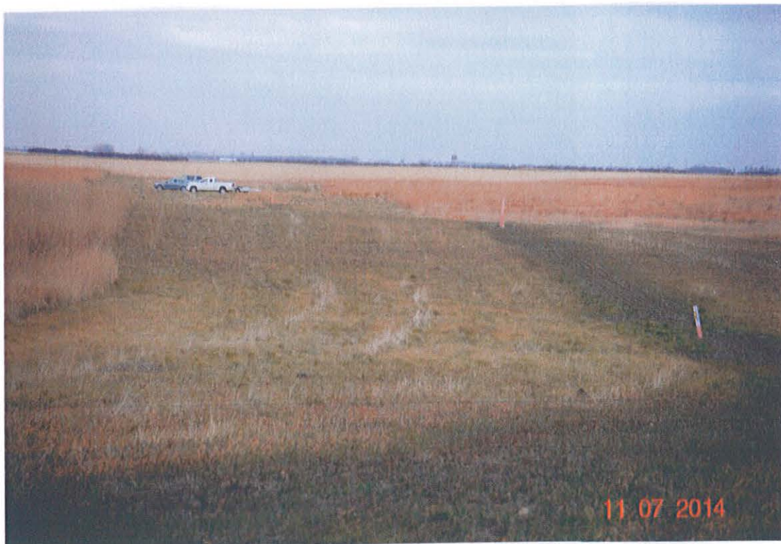
Pump station north of Subson property