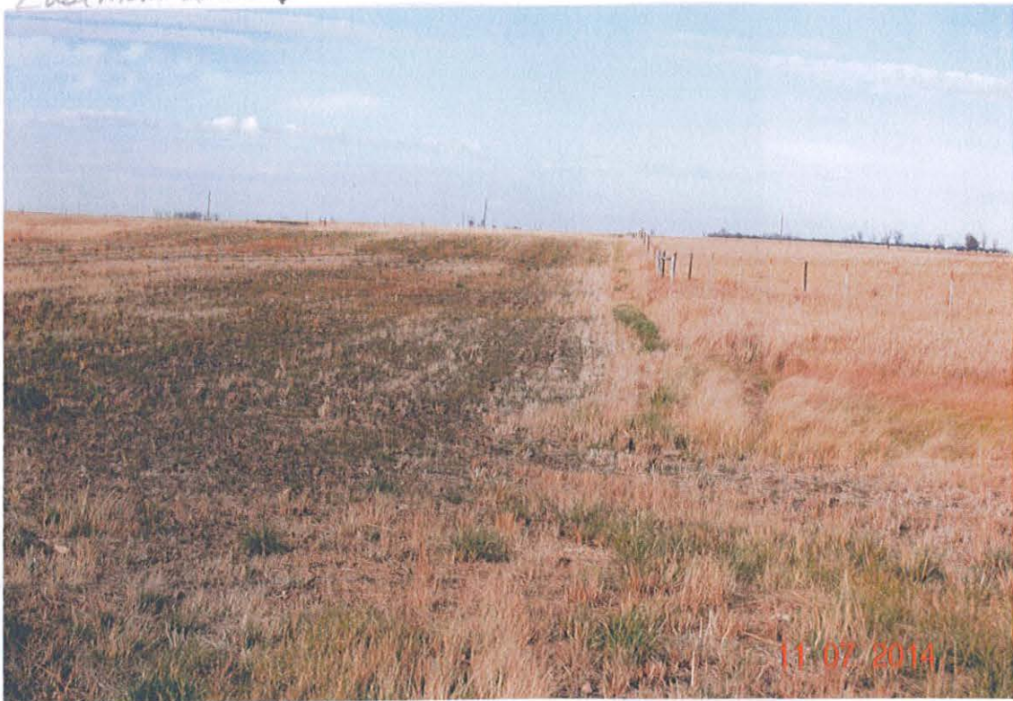
Easement Area ↘