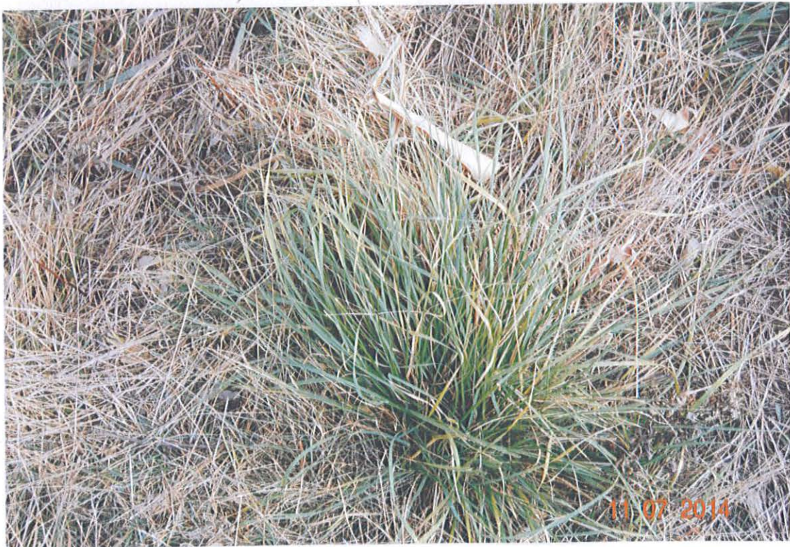
Twisted (clumps) of thickspiked wheat grass Livestock will not eat.