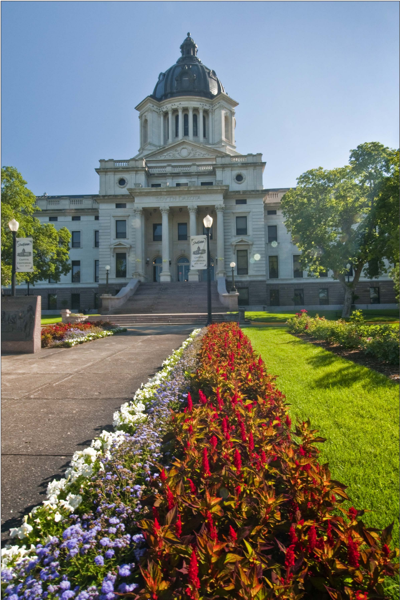
20 South Dakota State Capitol in Pierre.